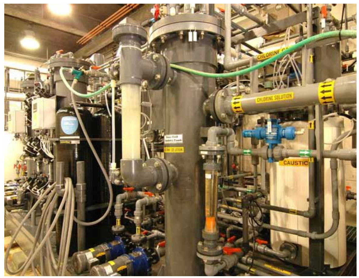
A new $2 million Klorigen Unit is now in operation at the Algiers Water Treatment Plant. The unit produces chlorine disinfectant on demand for the water treatment process by using food-grade salt and electricity. The driving force for using this system is risk reduction by eliminating the need to store tons of liquid chlorine onsite which could release to the atmosphere.