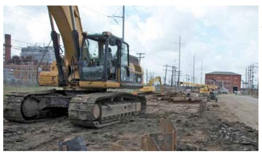
Construction work at Dwyer Pumping Station

page click Current Projects and then select Drainage (SELA).