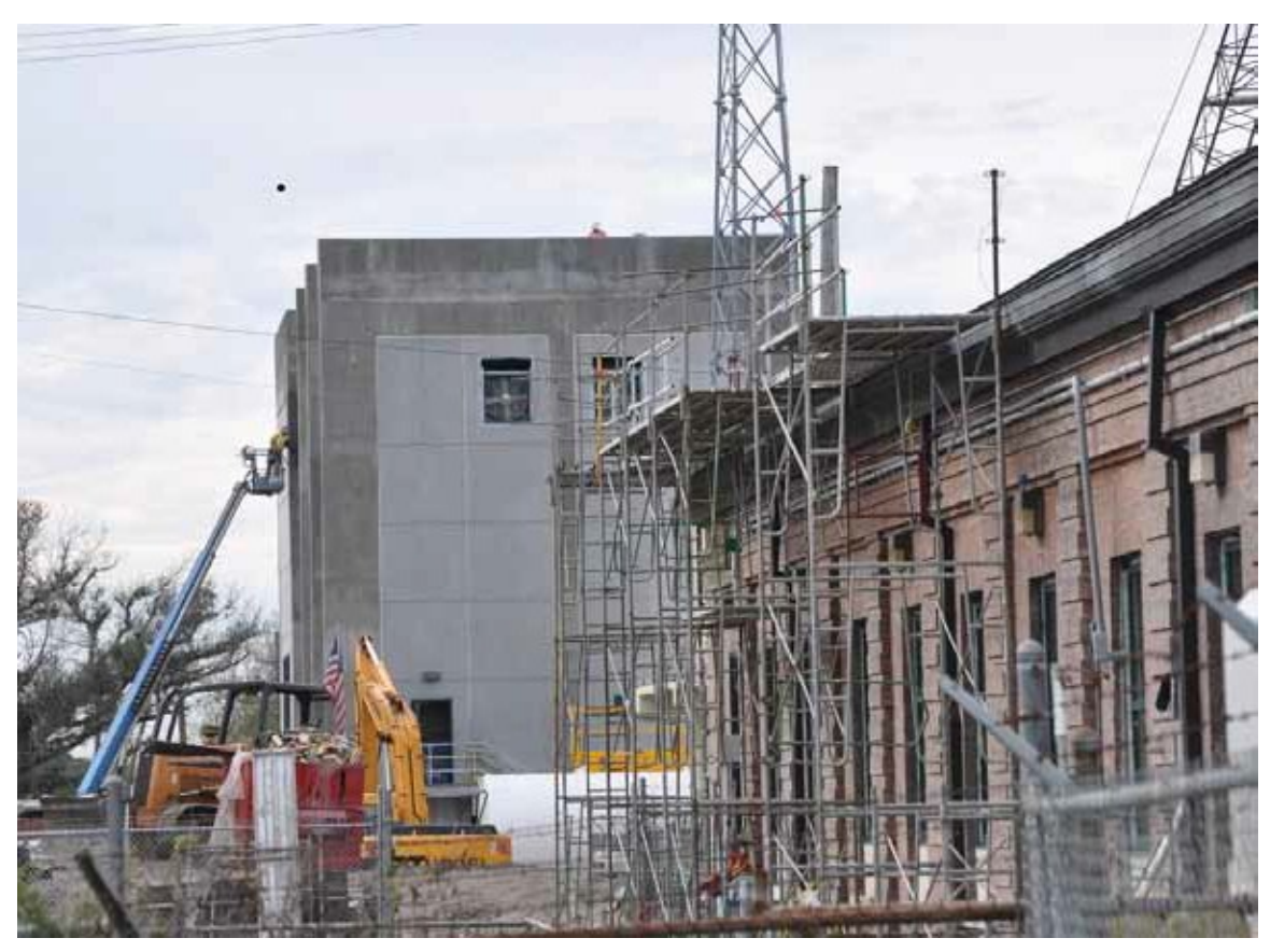
Storm proofing work on Drainage Pumping Station 6