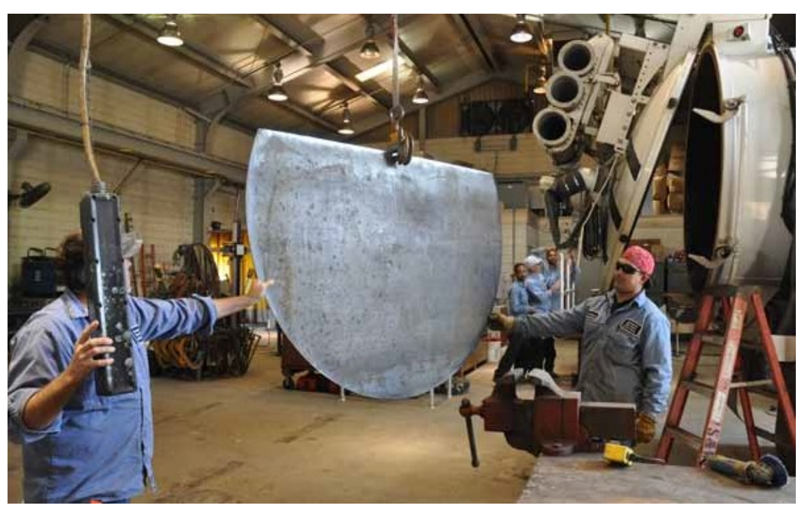
The men and women of the Board's Welding and Fabrication Shop have the capability and expertise to manufacture parts for some of the aging, yet reliable Board systems. Many of the parts are either no longer made or too expensive to job out or buy "from the shelf." So the work of the Shop not only recreate parts to exacting specifications, but its team of craftsmen can also save money for the Board.