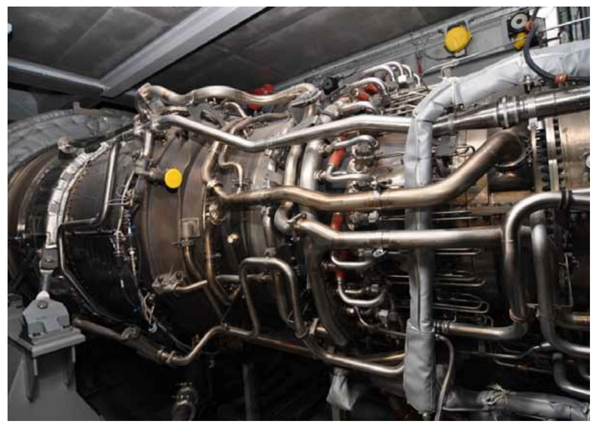
This specially-designed turbine will power a 15-megawatt generator being constructed by the U. S. Army Corps of Engineers. The generator will give the S&WB's Division of Pumping and Power the capability to improve the operation of its drainage, sewerage and water pumping systems in emergencies. The, generator, funded 100% by the Corps, is part of a storm-proofing project for Orleans Parish. The project, located on the grounds of the Carrollton Water Purification Plant, will cost in excess of $32 million. It is scheduled for completion in 2012.